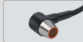
Transducer PT-06 (optional)