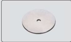
Standard block (included)