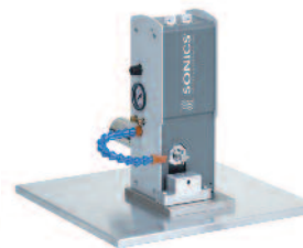
MWP40 Actuator on Plate