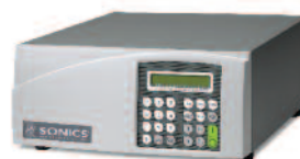
MX Series Power Supplies

MSC SmartControl with Time, Energy and Height-Based Weld Modes