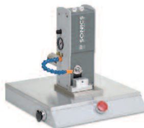
MWB40 Actuator on Integral Base